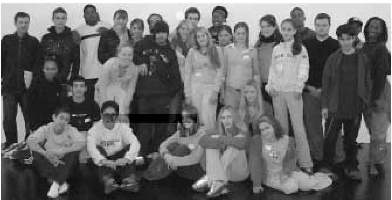
RADA's first Youth Group, ready to go

“ Our outreach programme has led to many graduates returning to extend their training, to share their skills with young people ”