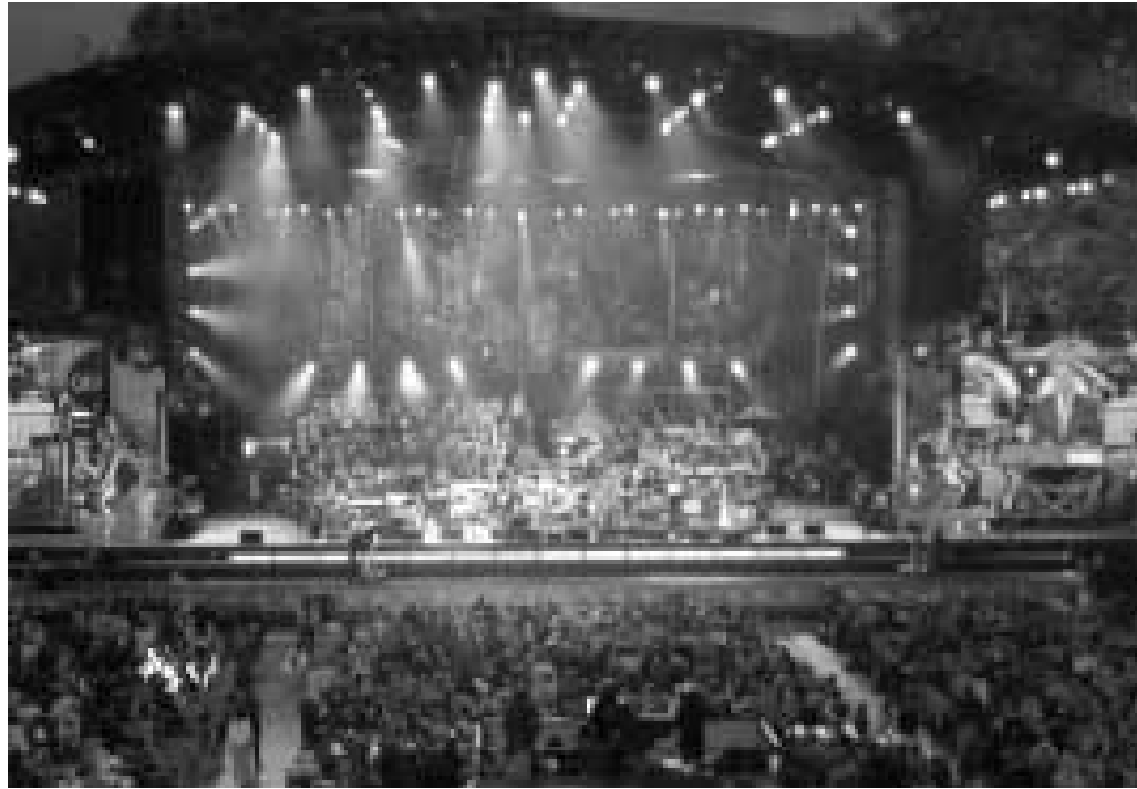
The biggest shows in town

"Of course mate," came the reply. "Just go round the corner and head down Grosvenor Place until you see it on the left just after half way." I thanked him and set off.