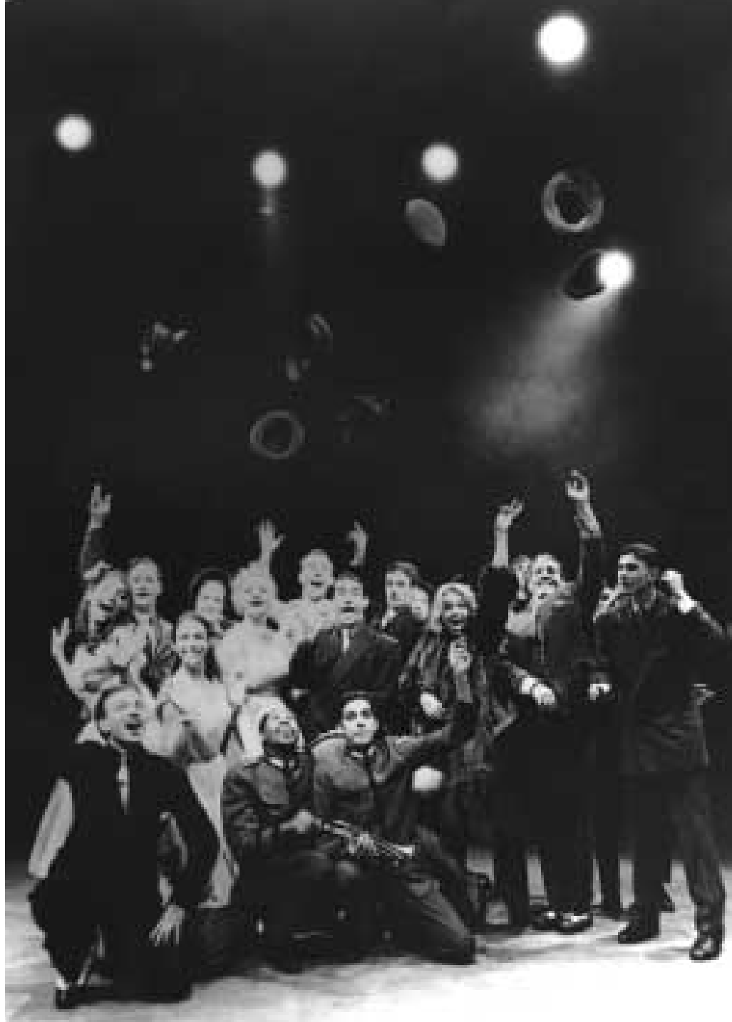
Guys and Dolls : In-the-round first for the Jerwood Vanbrugh