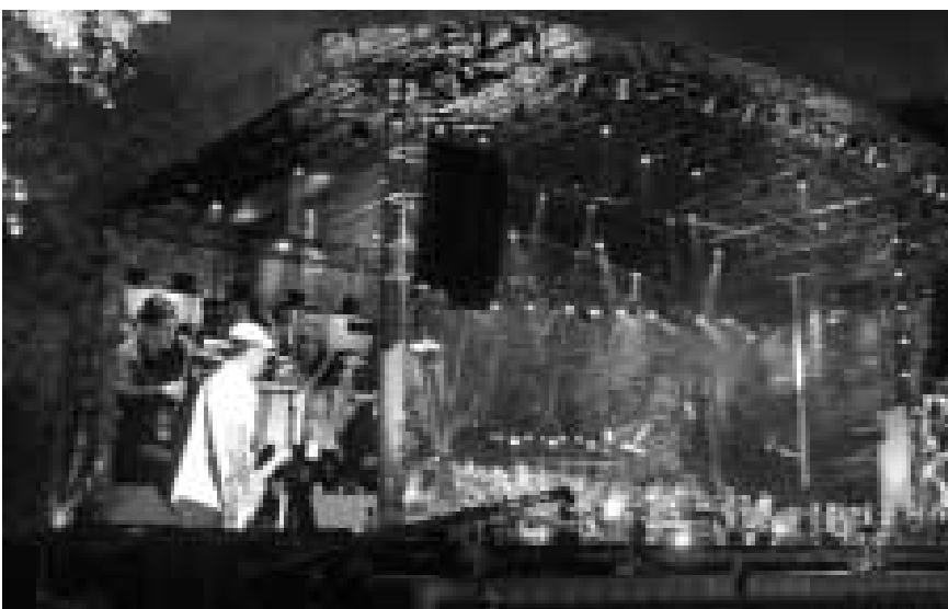
Lights and stars: rocking at the palace